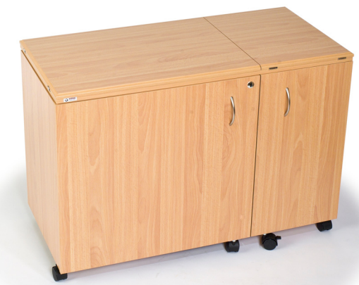
The CALYPSO - still compact when Closed

Fitted with our Horn Maxi air-lifter! Ideal for the new extra large sewing machines— such as the New Bernina 800 series, Brother Innov-is I, Janome Horizon 7700 and the 12000 amongst others but its not just for larger machines its also ideal for all normal sized domestic sewing machines too!