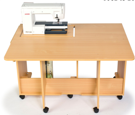
The QD2 - with the back work area up - rigid stability on the 2 supporting legs!