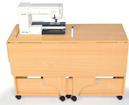
The QD2 - with the back work surface down

INCLUDED- the QD2 is automatically supplied with a filler piece (not pictured here) which fills in the hole left when your machine is stored away, so with the back area up it will create a large solid cutting area.