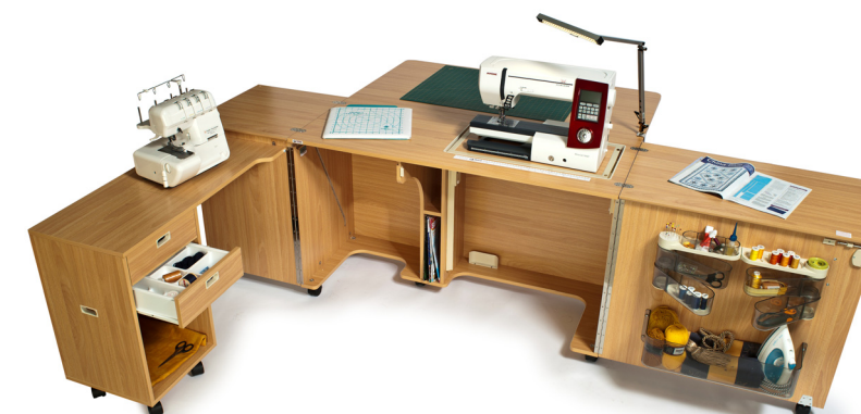
The SUPERIOR - Fully expanded The clever design allows you to relocate the pull out caddy onto the door by means of keyhole connectors thus giving even greater access & leg room

Finished with an attractive soft formed edge