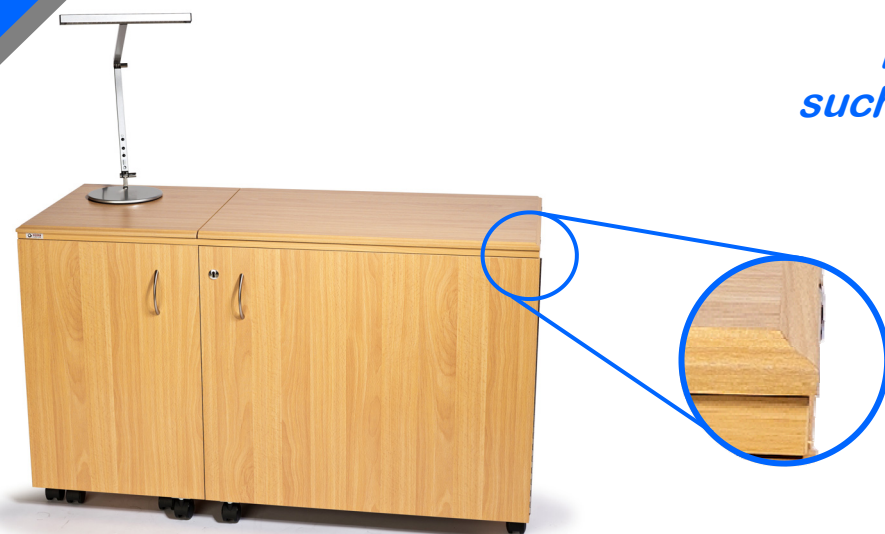
The SUPERIOR - Closed From its large proportions when opened, it has the ability to close down dramatically

Fitted with our Horn Maxi air-lifter! Ideal for the new extra large sewing machines— such as the New Bernina 800 series, Brother Innov-is I, Janome Horizon amongst others